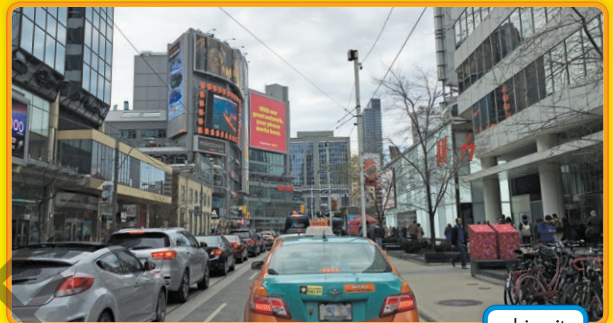
a big city