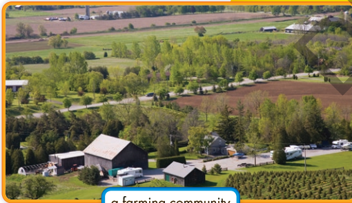
a farming community