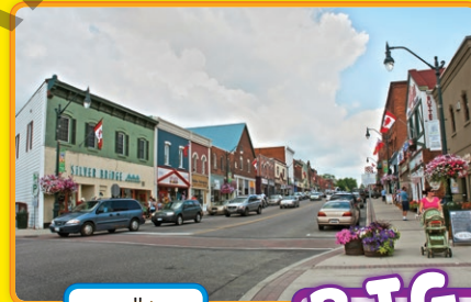
a small town